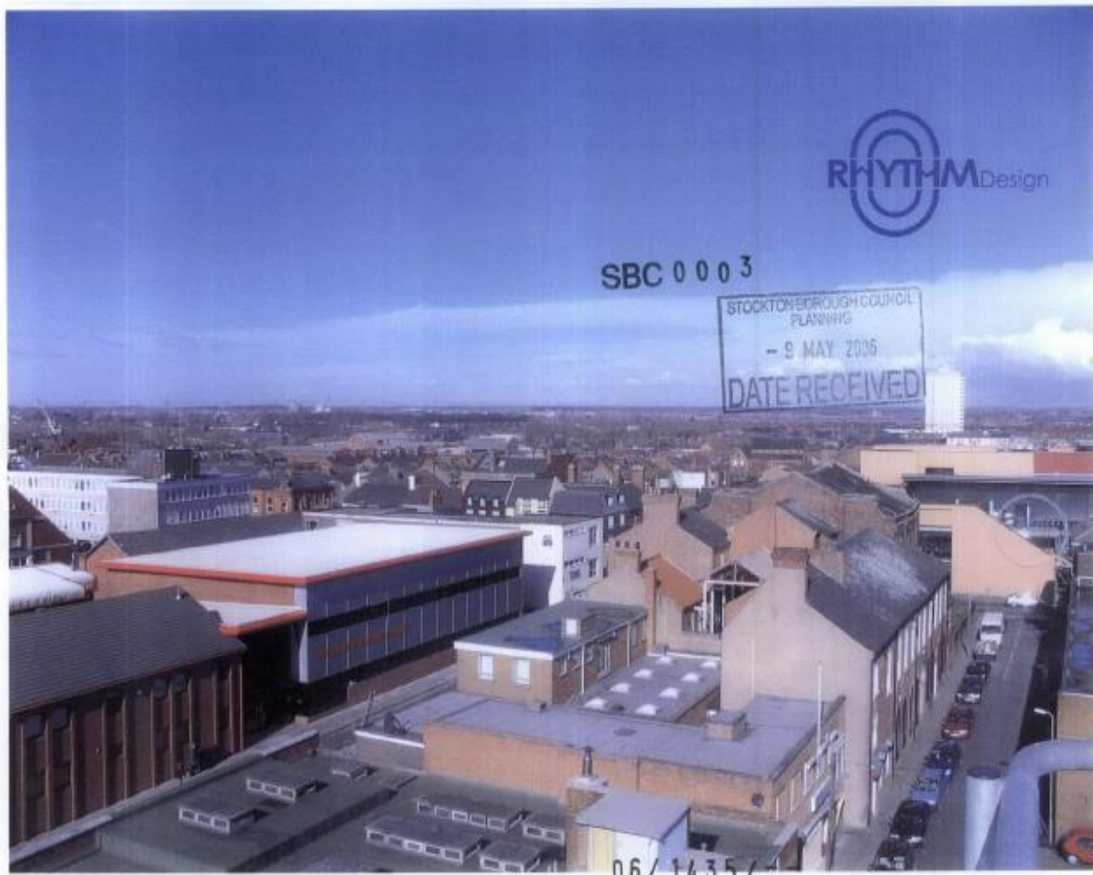
Photomontage 3 - Roofscape