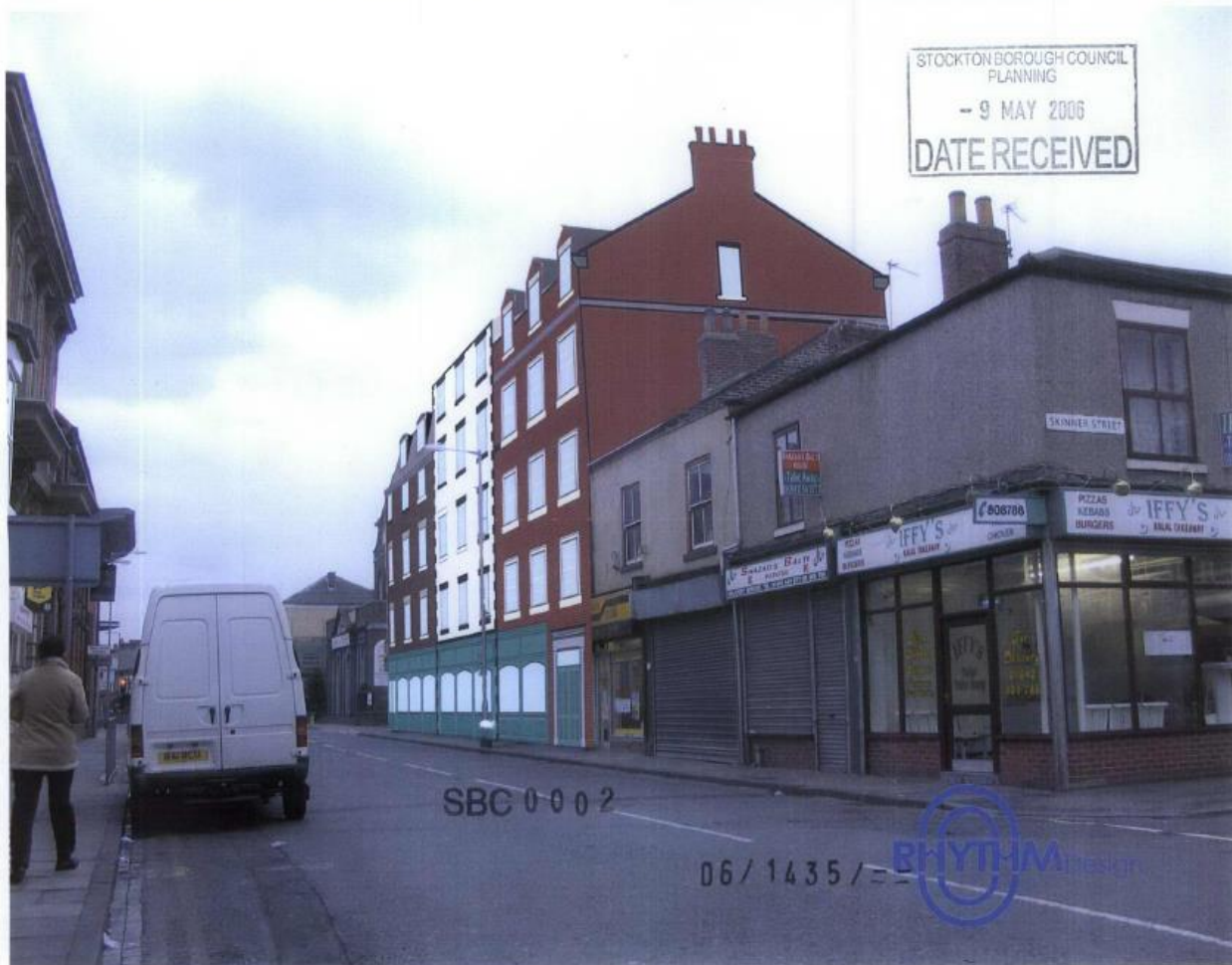
Photomontage 2 – Looking Towards the Town Centre