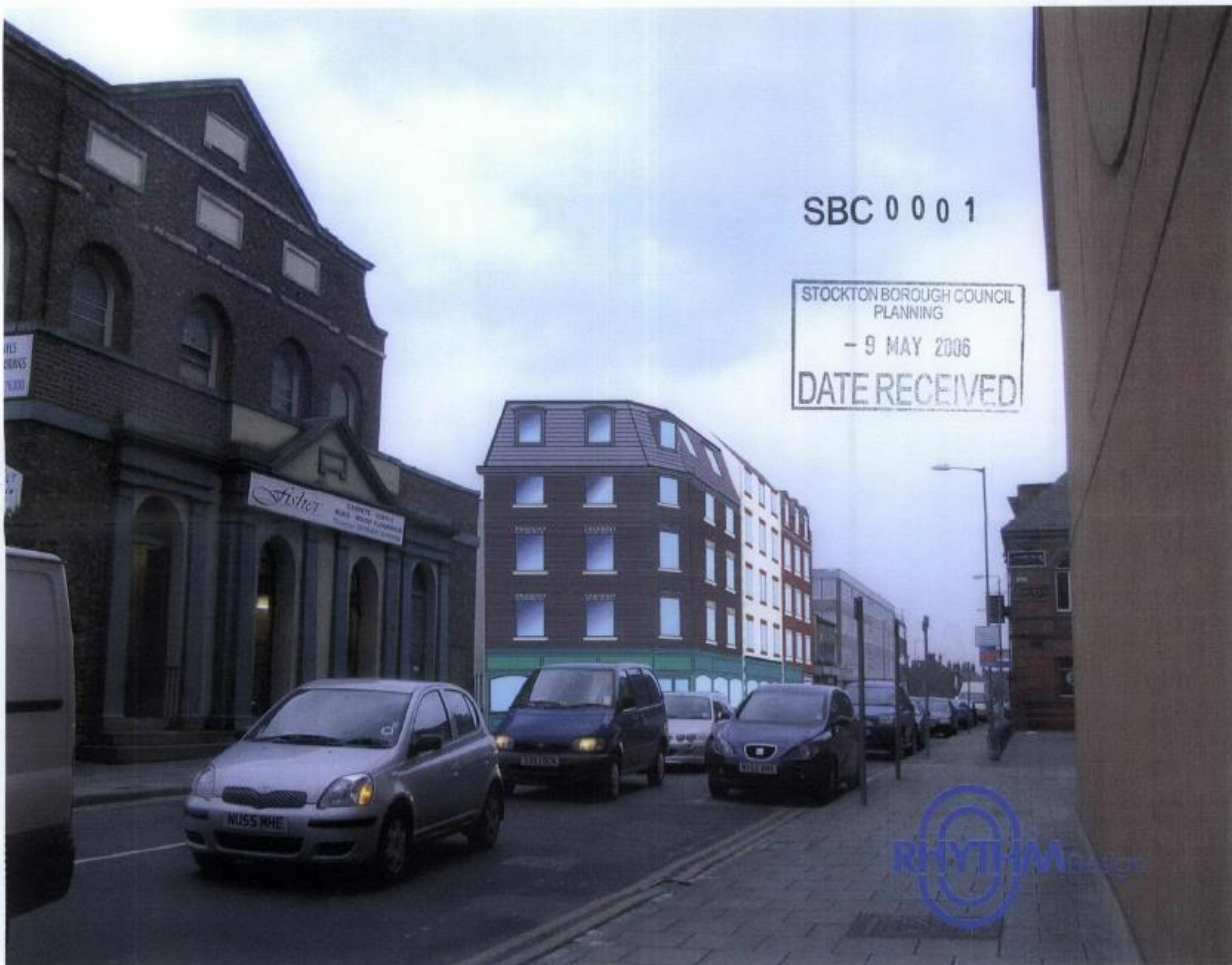
Photomontage 1 – Looking up Dovecot Street